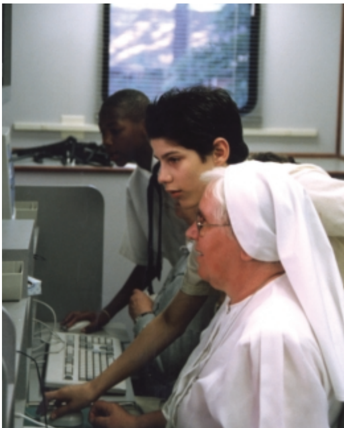
Above, the Children's Village computer bus travels into the community with WAY participants as teachers. Below, the Children's Village greenhouse, a worksite on the campus of the agency's residential treatment center.